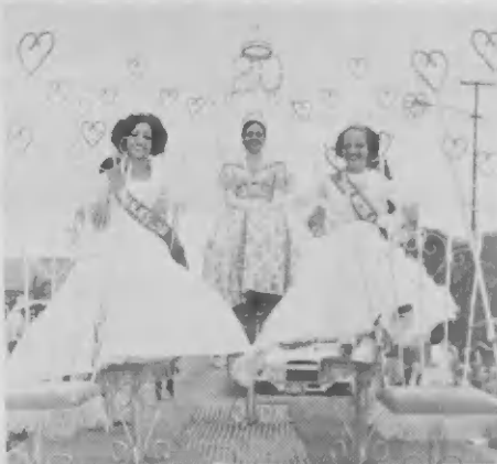
Local and Foreign Queens